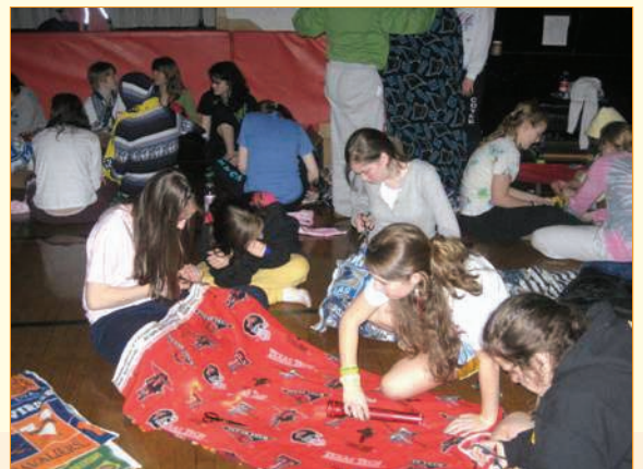
Maryvale students were able to sew 10 fleece blankets for needy families despite spending the night without electricity in a cold gymnasium.

Thank you to the following organizations who generously helped to support this event: Applebee's, Baltimore Coffee & Tea, Boardwalk Fries, Carroll Independent Fuel Co., Costco, GT Pizza, Giant Food (Hunt Valley and Towson locations), Mars Super Markets, Noodles and Company, Panera Bread, Pizza Hut, Starbucks and TCBY.