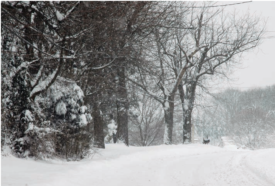
The Fuel Fund anticipates increases in requests for services because of the harsh winter of 2010.

The Fuel Fund of Maryland does not share, sell, lease, or otherwise provide contributor information to any other organization or business. The Fuel Fund of Maryland, Inc. is a 501(c)(3) nonprofit organization – donations to which are tax deductible to the fullest extent allowed by law. Financial report is available upon request from Fuel Fund of MD, 305 W. Chesapeake Ave., Suite 115, Baltimore, MD 21204-4435. Telephone number (410) 821-3022. Documents and information filed in accordance with the Maryland Charitable Solicitations Act available upon request from the Secretary of State, State House, Annapolis, MD 21401 for the cost of printing and postage.