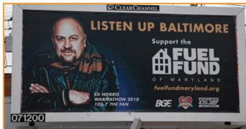
Billboards help increase awareness of the Warmathon.